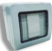
WATER PROOF SW.